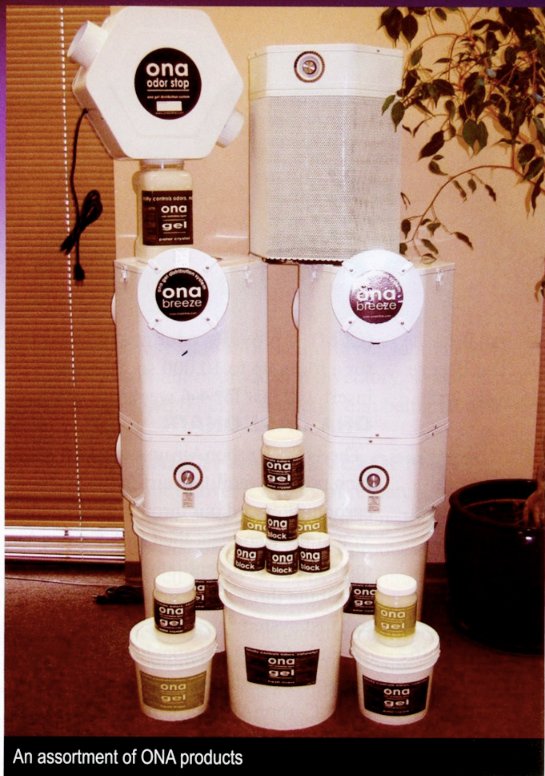
An assortment of ONA products